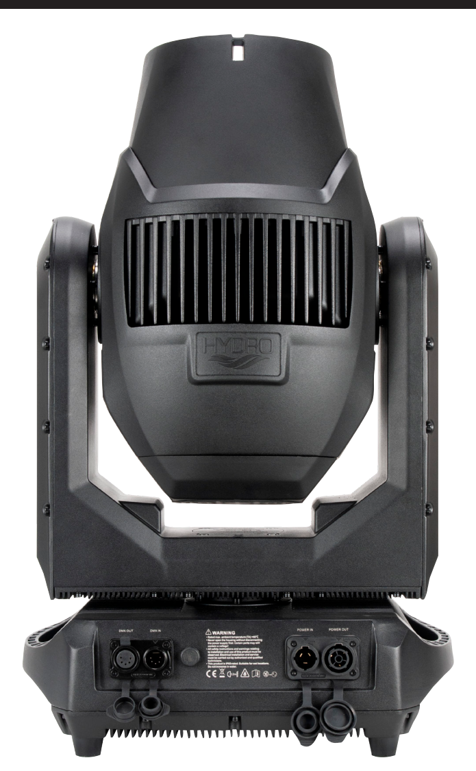
.IP65 Rated DMX & Power Sockets with Protective Rubber Covers